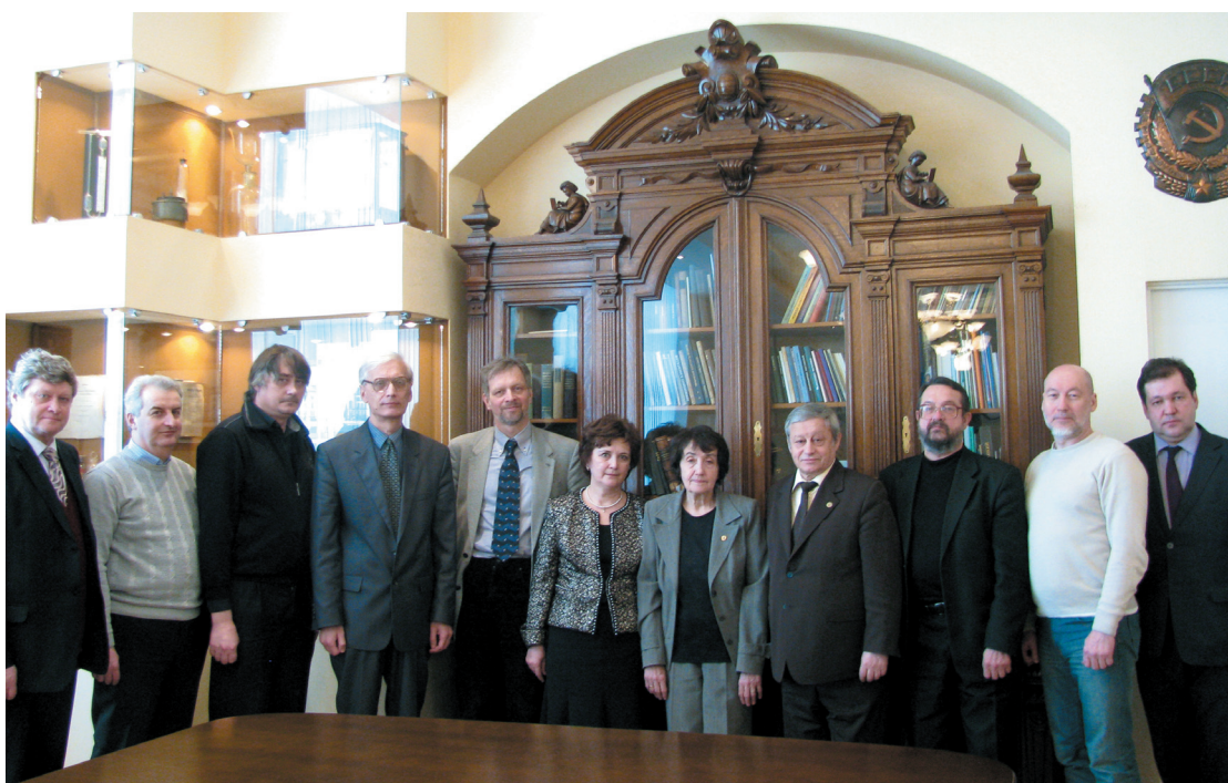
Acad. I. P. Beletskaya with the participants of the scientific seminar on macroheterocycles in Ivanovo State University of Chemistry and Technology (2012)

Редакция журнала «Макрогетероциклы» сердечно поздравляет академика Ирину Петровну Белецкую с юбилеем и желает ей здоровья, благополучия и новых научных побед!